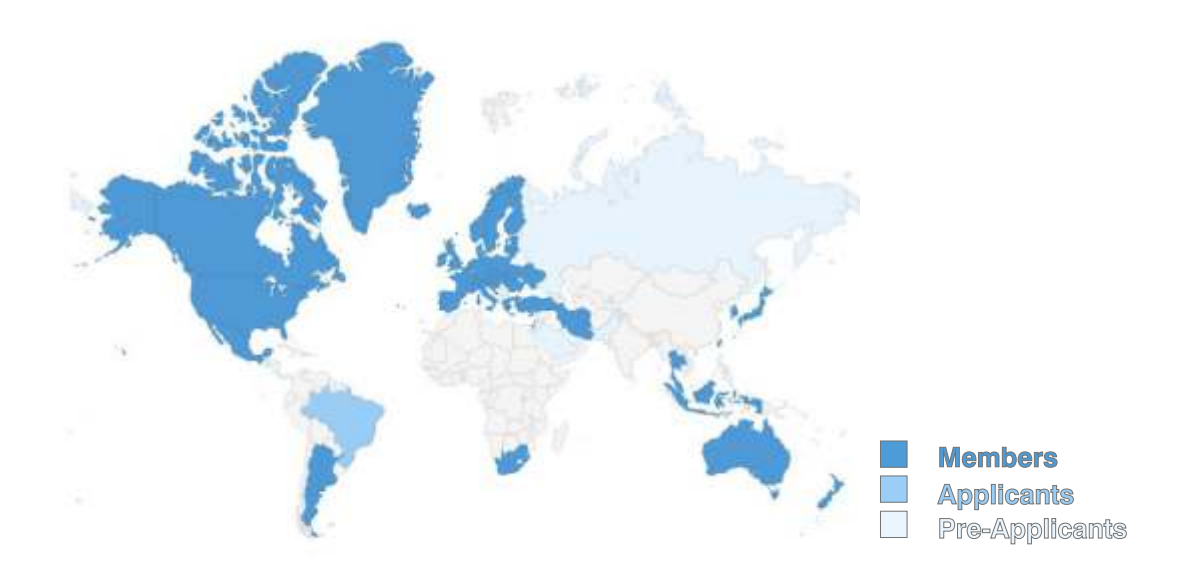
> For more information on PIC/S Members: https://www.picscheme.org/en/members

The Pharmaceutical Inspection Co-operation Scheme (PIC/S) is a non-binding co-operative arrangement between Medicines Regulatory Authorities in the field of Good Manufacturing Practice (GMP) of medicinal products for human or veterinary use. It is open to any Authority having a comparable GMP inspection system. PIC/S presently comprises more than 50 Participating Authorities (Members) coming from all over the world.