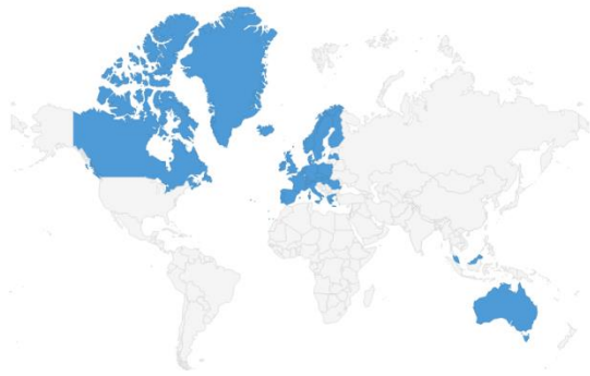
PIC/S 29 Members in 2006