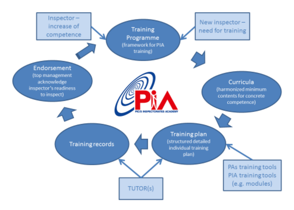
Outline of PIA Training Cycle

In parallel, a harmonised PIA Training Programme has been developed, including a training curricula and cycle (see chart below) as well as a qualification process. The PIA Training Programme aims to define harmonised minimum requirements for the training of inspectors in specific fields (e.g. API, sterile, biologicals, etc.). Training is based on high quality training materials focusing on GMP requirements and inspection skills, to be delivered through various formats. The formats are provided either through training tools offered by PIA or by the PIC/S PAs or both. While PIC/S establishes a PIA Training Programme, PAs remain responsible for the training and is exclusively responsible to determine the training for each inspector.